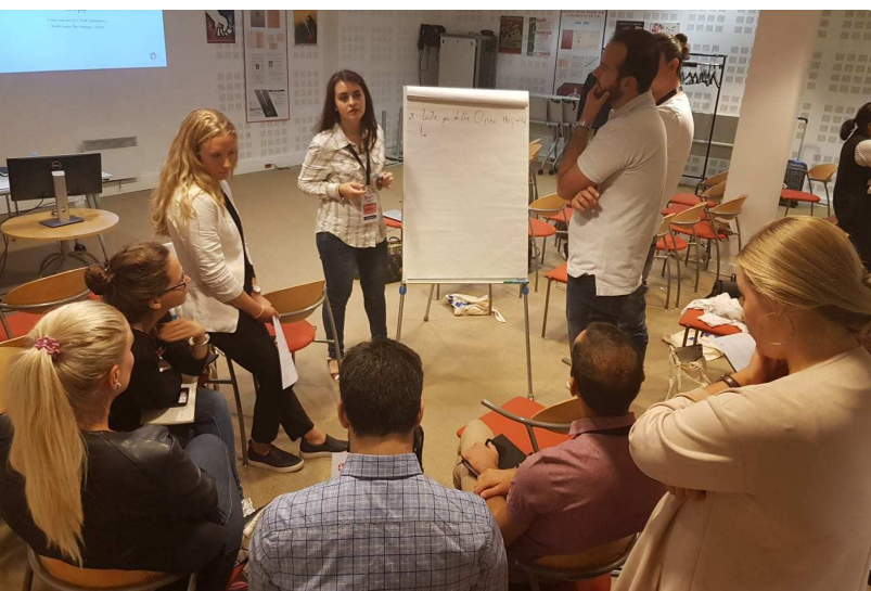
Field visit at Gustave Roussy Institute of Oncology